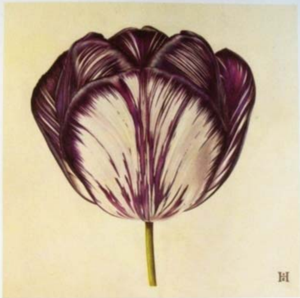
Tulipa 'Talisman' Bybloemen Flame (2003) Celia Hegedus Watercolour on vellum 600 x 600mm