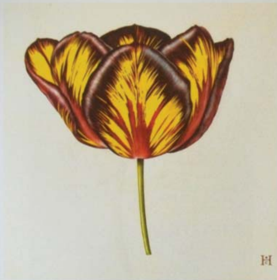
Tulipa 'Lord Stanley' Bizarre Flame (2005) Celia Hegedus Watercolour on vellum 600 x 559mm