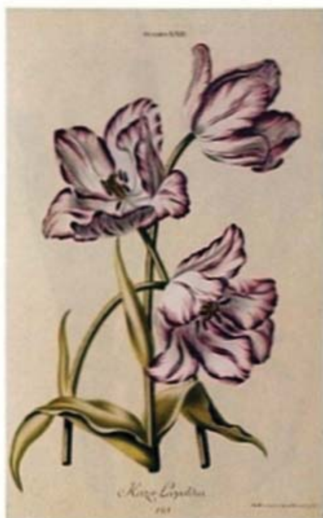
Tulipa 'Kaiser Leopoldus' (c1751)

Original at the Royal Horticultural Society, Lindley Library